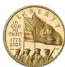
55 Gold Coin