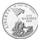
Silver Dollar Coin