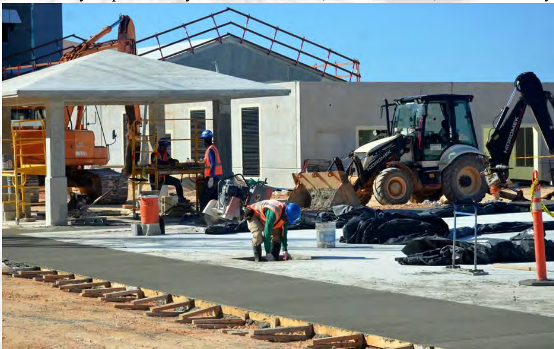
Contractors work on bachelor enlisted quarters at Marine Corps Base Camp Blaz, Guam, Dec. 10, 2024.