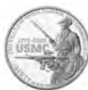
Clad Half Dollar

The new coins honoring the Marine Corps' 250th birthday.